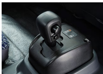
AMT model shown