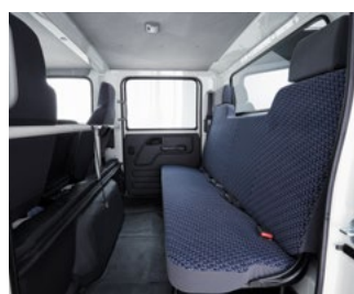
Crew cabin rear